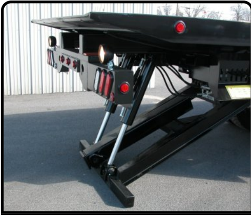
• Hydraulic Stabilizer Bar with Pintel Hitch

IMPORTANT: Gross vehicle rating limitation must be considered. Ratings are based on structural factors only, not chassis capacity. Danco's body ratings are based on a water level capacity. Danco specifications shown are approximations and may vary depending on chassis selected. Prices and product specifications are subject to change without notice. Consult with state and local laws for the maximum vehicle lengths allowed. Optional equipment may be shown in photographs and may not be part of the standard package. Optional upgrade prices not included in standard pricing. See dancoproducts.com for a more complete list of specifications. * Optional upgrade prices not included in standard pricing. All prices are installed, Freight on Board Greencastle, PA